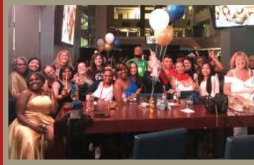
SLR Associate Celebration 2022