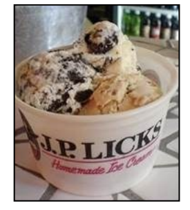
Peanut Butter Cookies N' Cream