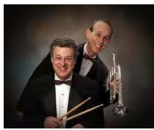
The Winiker Band

Olmsted Residents' party is Thursday, December 19<sup>th</sup>, 5:30-7:30 in the Main Dining Rooms on Traditional Assisted Living. Our event will start with an hors d'oeuvre reception with family photos and Santa Claus visits. This will be a great time to get multigenerational photos taken of your family. It is also fun for our residents' to see their grandchildren/great-grandchildren visit with Santa.