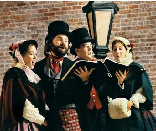
The Figgy Puddin' Carollers

Traditional residents and their guests are warmly invited to join us on Thursday December 12<sup>th</sup> from 5:30pm – 8:00pm. We will be hosting activities that are family friendly for all ages. For the