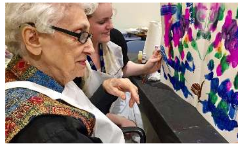
Opening Minds through Art program participants