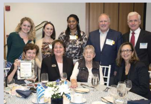
Team Goddard poses with the 2017 Program Innovation of the Year Award

Congratulations to all who participated in this wonderful program! 🏠