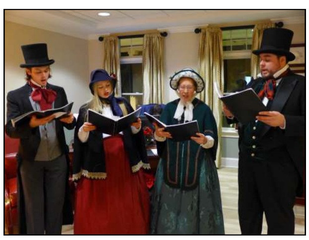
The Figgy Puddin Carolers