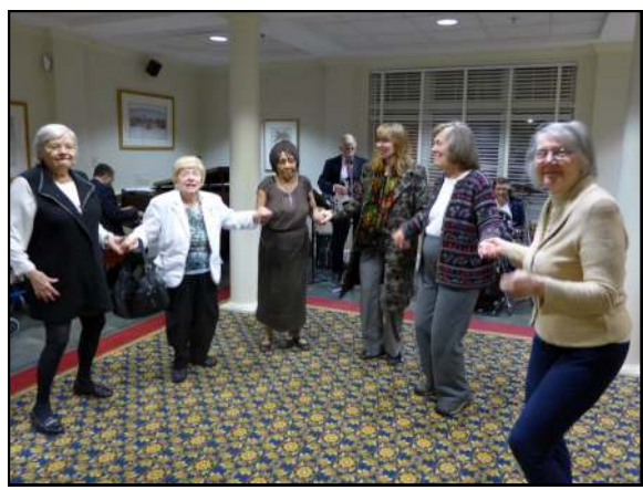
Guests enjoying the music and dancing the night away