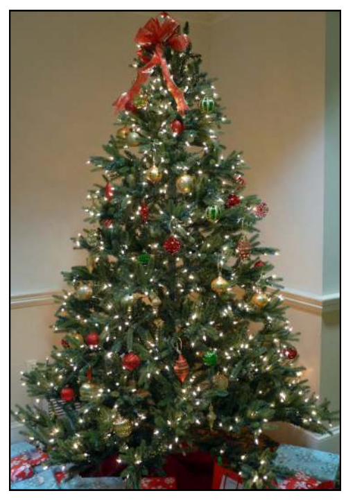
The Goddard House Christmas Tree

As guests arrived at Goddard House and began munching on appetizers, many watched the Figgy Puddin Carolers who strolled through the hallways singing festive songs. Many other guests went to the bar, where they could get one of our vibrantly colored blue or red cocktails. Small red and white striped candy canes dangled from each of the red martini glasses as guests milled about. Another popular