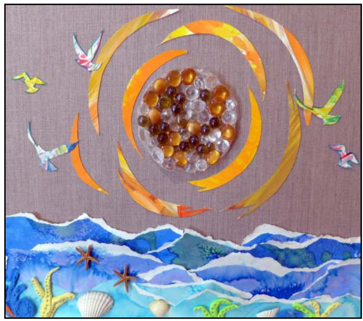
A close up view of Sandy's art work

During next two weeks residents were encouraged to use their senses. Mediums that were used included watercolor mixed with a salt and clay manipulation. These activities created the ocean on the bottom and the coral, which was placed by the residents. We began talking about traveling and