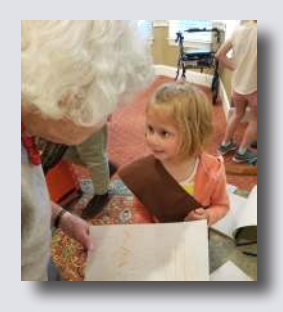
Girl Scouts from Runkle Elementary earned their painting badges with Goddard House residents!