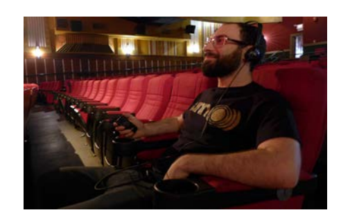
Assistive Listening/Audio Descriptive Receivers with Headset

"At the theater, the box office and/or projection staff can quickly instruct people how to use the devices. A pen and paper is easily ready for folks who would rather communicate by writing. We hope that all feel welcome and we appreciate any feedback. So far it's been very constructive and positive!"