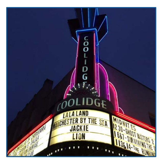
Coolidge Corner Theater

This is a receiver worn casually on your hip or held in the hand. It also can come with a lanyard that acts as an induction loop. The Coolidge has reduced the size and improved the sound quality of the device and headphones (or neck-loop). Nick has also added two in-house microphones in the larger movie houses, one and two, so that live movie introductions and post-show discussions are more audible and now run through the system into the devices.