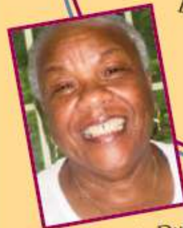
Minister Olivia Dubose