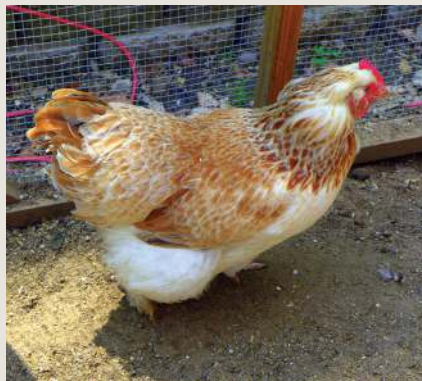
One of our Fine Feathered Friends

Green City Growers restarted our gardening season in April and will be here to maintain our indoor and outdoor gardens with us until the Fall. While they're here we will learn about and participate