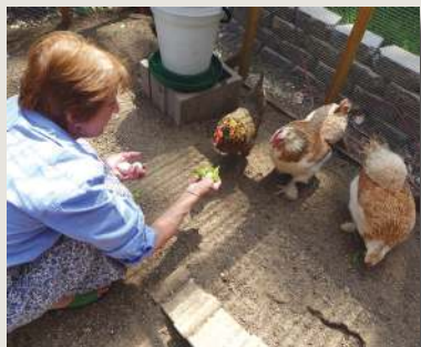
Residents helping on the farm

Our partnership with Green City Growers is now in its seventh year. We are so excited to see where this award winning program takes us next. The Goddard House Farm, now consisting of seven raised garden beds, six chickens in our hen house, some