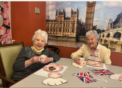
Our “Grab Your Passport! Destination: England” tea party is enjoyed by (clockwise, from bottom)