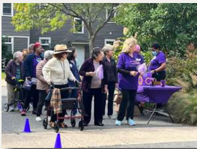
Residents and Associates at the start line!

On a sunny morning in late September, residents, associates, and family members came together to raise awareness and funds for the Alzheimer's Association. Participants walked or rolled several laps around the Gazebo, or found a seat out front to cheer everyone on. The feeling of the event was positive and uplifting, with upbeat music in the background, refreshments, and purple accessories. Each year, associates from all departments come together to hold this meaningful event that leaves an impact.