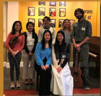
Above: Longy School of Music students play for Goddard residents as part of their Music as a Healing Art program